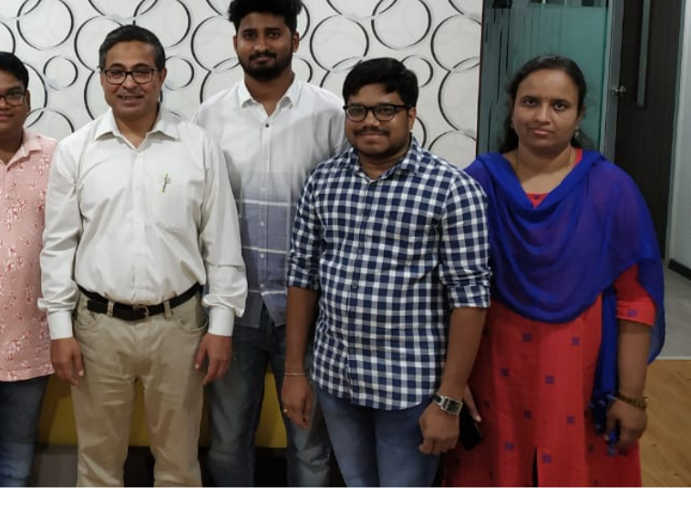
(1) Manjeera Trinity Corporate tower, where Infoglen opened it's Hyderabad office; (2) Group photo at the office reception; (3) Lip smacking Motichoor Laddoos, Kova Badushas, and Dodda Burfis after the ribbon cutting of Infoglen Hyderabad office; (4) Team lunch with Garlic Dosa, Babai Idli, Andhra Thali, MLA Dosa, Filter Coffee, and many other yummy stuff.