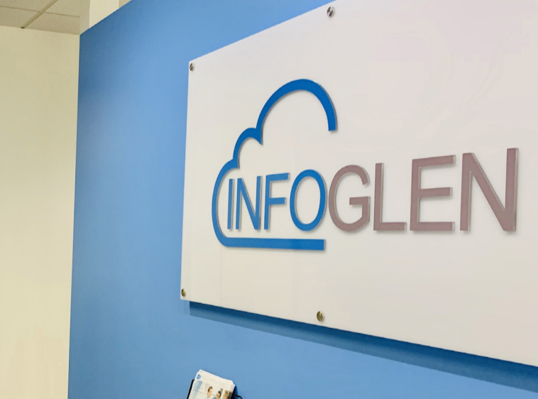
(top)100 Century Center Court, San Jose where the new Infoglen HQ is located ; (bottom) Team lunch after the office inauguration.